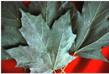
Powdery mildew on maple.