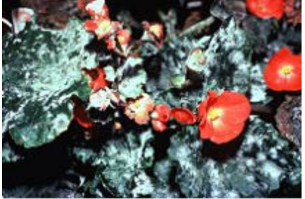
Powdery mildew on begonia leaves.

dormancy, and the infected plant may become extremely unsightly. On roses, uncontrolled powdery mildew will prevent normal flowering on highly susceptible cultivars.