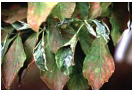
Powdery mildew on dogwood leaves. Note the distortion on affected leaves.

Susceptible woody plants include some deciduous azaleas, buckeye, catalpa, cherry, a few of the flowering crabapples, dogwood, English oaks, euonymus, honeysuckle, horse chestnut, lilac, privet, roses, serviceberry, silver maple, sycamore, tulip tree, some viburnums, walnut, willow and wintercreeper. Powdery mildews are also common on certain herbaceous plants, such as chrysanthemums, dahlias, delphiniums, kalanchoes, phlox, Reiger begonias, snapdragons and zinnias. Remember that each species of powdery mildew has a very limited host range. Infection of one plant type does not necessarily mean that others are threatened. For example, the fungus that causes powdery mildew on lilac does not spread to roses and vice versa.