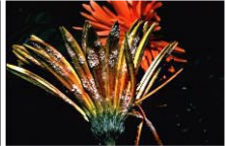
Powdery mildew on gerbera.