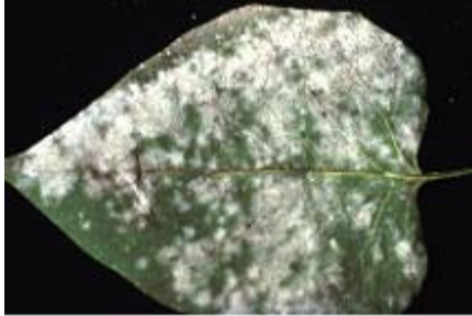
Powdery mildew on lilac leaf.