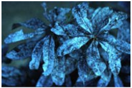
Powdery mildew on azalea leaves.